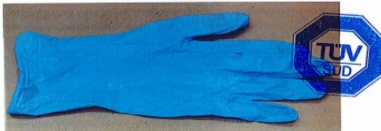
Photo: Powder Free Nitrile Examination Gloves, KICHY GLOVE, Blue, Size S