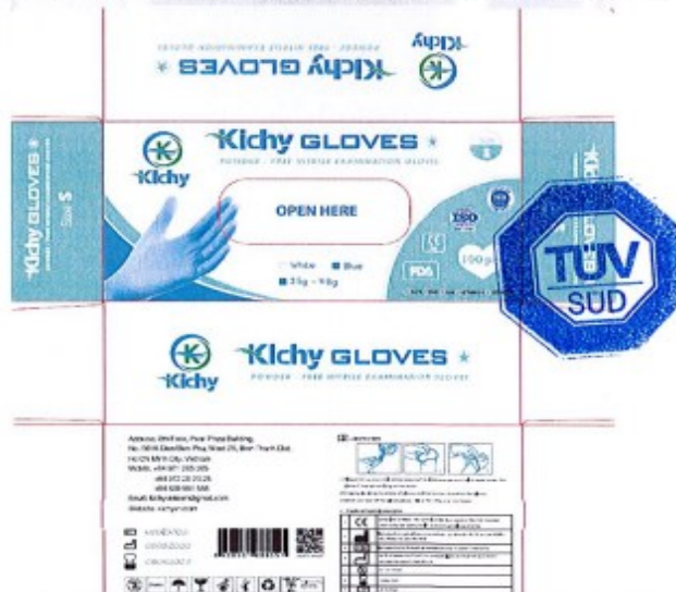
Photo 2: Packaging artwork for Powder Free Nitrile Examination Gloves, KICHY GLOVE, Blue, Size S