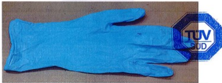
Photo 1: Powder Free Nitrile Examination Gloves, KICHY GLOVE, Blue, Size S